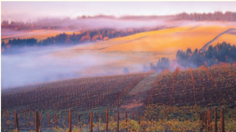
Watch enveloping morning mists drift above serene Provençal vineyards that yield vintages prized by connoisseurs around the world.

Founded in the fifth century B.C., this bustling community in the famous Côte d'Or département has long been the capital of Burgundy wines and a city of art. A stroll through Beaune reveals historic mansions, medieval half-timbered houses and, last but not least, the exquisite 15th-century Hôtel-Dieu. A quintessential example of Burgundian Renaissance architecture distinguished by its dazzling, multicolored glazed roof tiles, it reflects when the power of the Duke of Burgundy stretched from Flanders to The Netherlands. Its meticulously restored chambers provide a fascinating glimpse into life during the 15th century and hold an impressive collection of period art including the brilliant Last Judgement by Rogier van der Weyden.