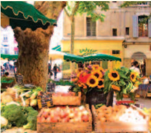
Pick out your favorite flavors from Provence's fields and orchards in Aix's colorful outdoor market.

*Complete details will be provided with your reservation confirmation.