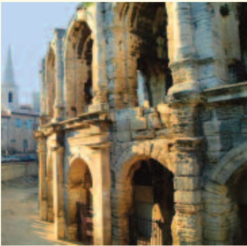
Stand in the footsteps of gladiators and centurions amid the grand ruins of Arles' 2,000-year-old Roman Amphitheater.