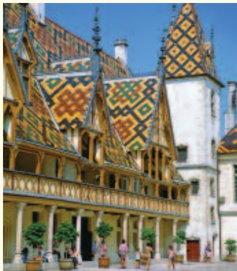
Step into the enchanting world of 15th-century Burgundy at the historic Hôtel-Dieu in Beaune.

CULTURAL ENRICHMENT: The Sisters of the Blessed Sacrament host a reception for us with the warm hospitality of a typical French village.