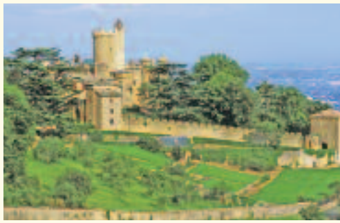
The castle-like Château Montmelas lies in the heart of the Beaujolais villages, surrounded by bucolic vineyards.