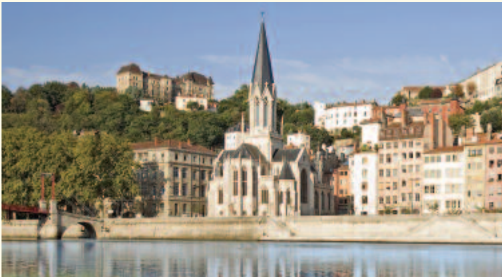
Tucked at the foot of Fourvière Hill, Lyon romances visitors with its covered pedestrian passages, elegant Roman architecture and charming Old Town. Inset above: Grape harvesting in Provence.