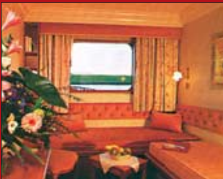
Deck B Stateroom