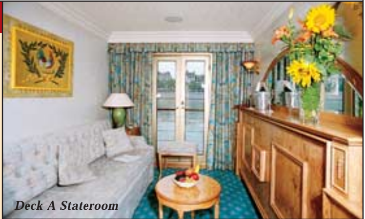
Deck A Stateroom

Aboard the M.V. PRINCESSE DE PROVENCE, there is one crew member for every 2.5 passengers, allowing for a very high level of professional and attentive service.